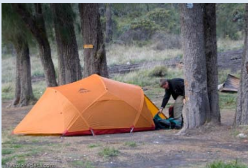
Tent Camp at Kali Mati