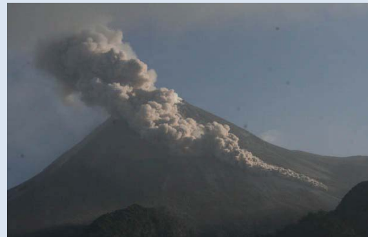
Mount Merapi lava Glowing

This trip is easy challenging for explore Volcano in Java, all of this trip will be exploration Active Volcano.