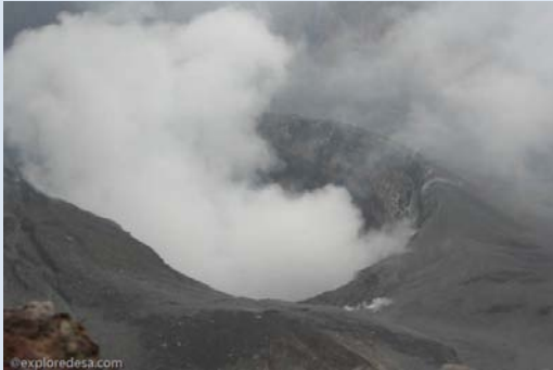
Mount Raung Crater